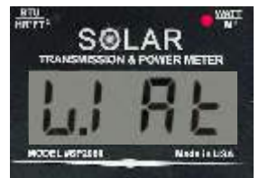
Indicates W/m 2