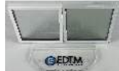
#HS2056 Demonstration Base