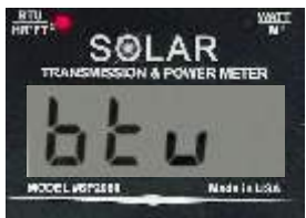
Indicates BTU/hr*ft 2