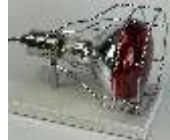
#HL1040 Heat Lamp

For more information and a complete list visit EDTM.com .